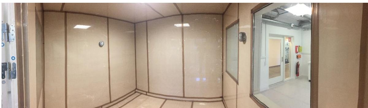
Figure 1: Panoramic view of the climate chamber